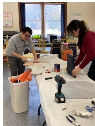
Cornell student volunteers who helped re-cover chairs before classes started in January